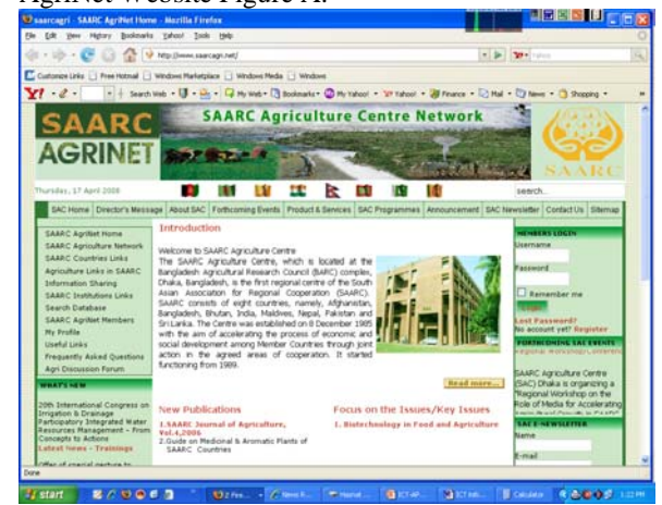
Fig.A (Home Page of SAARC AgriNet website)

SAARC AgriNet website (www.saarcgri.net), developed on the open source software tools, such as Joomla, HTML, PHP, is used for creation of web pages and application programmes to design value-added information services on the website. MySQL database software is used to create different database services on the website. SAARC AgriNet also made use of strengths of web-based applications of development partners to create discussion forums and e-mail -based newsletter services etc. Home Page of AgriNet Website Figure A.